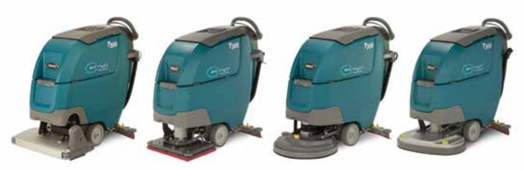
Dual Cylindrical: 20 in / 500 mm

The T300 scrubbers have multiple machine head types to fit your cleaning applications and optimize cleaning performance for specific areas.